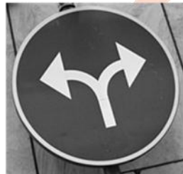
the Situation / the Problem?