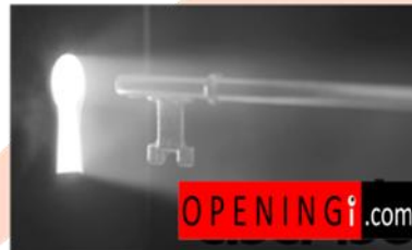
My Thoughts & Actions (Lösningsaktivitet)